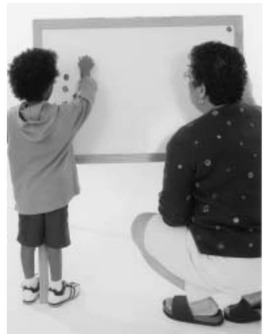
The accelerated progress that Reading Recovery children make in 12 to 20 weeks can only be achieved with one-to-one teaching.